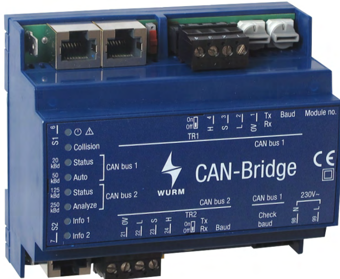
Fig. 1: CAN bridge front view