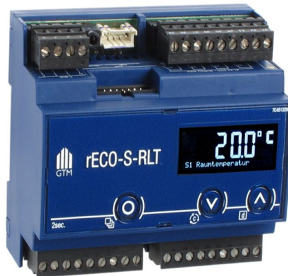
Abb. 1: Front view