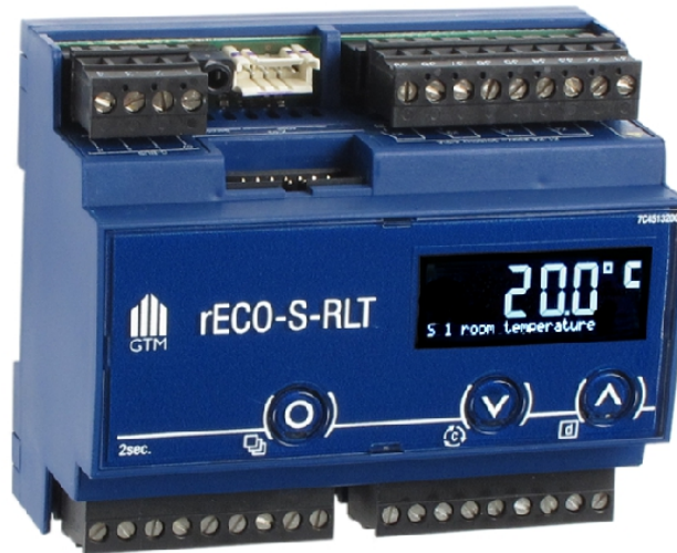
Fig. 1: Front view