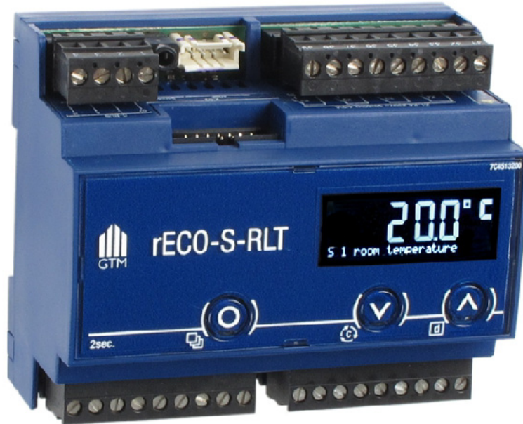
Fig. 1: Front view